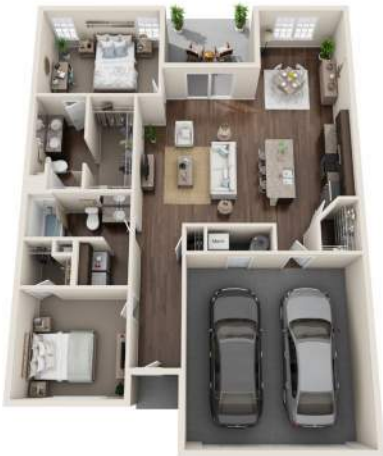
Willowood 1,381 SQFT