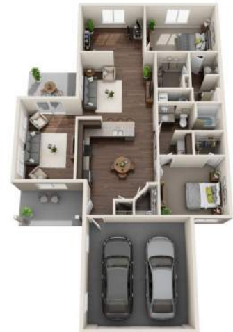
Summerwood 1,620 SQFT