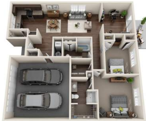
Ledgewood 1,427 SQFT