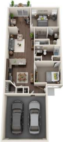
Forestwood 1,294 SQFT