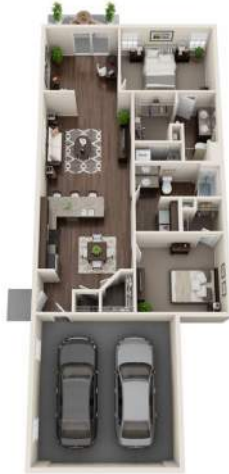
Meadowood 1,327 SQFT